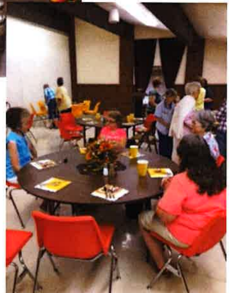
It was a wonderful time of food, friends and fellowship.