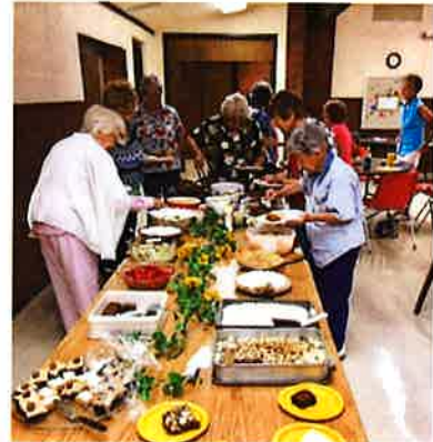
The Disciple Women held their annual Indoor Picnic on Monday, June 12 th with 26 in attendance.